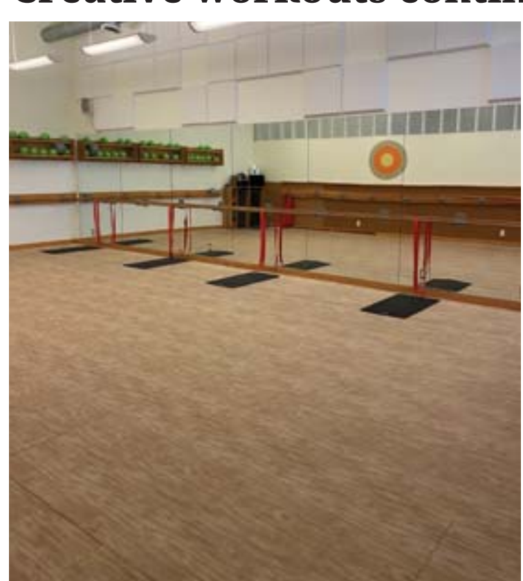
The Daily Method